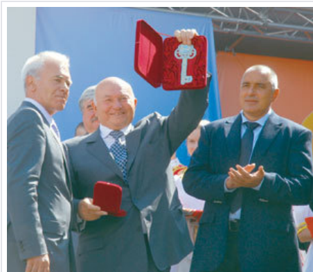
Mayor Avren Krasimir Todorov gave honorary key of the municipality by the mayor Luzhkov, once mayor cut the ribbon together with Bulgarian Prime Minister Boyko Borisov

Children's Wellness Camp Raduga "is built on a plot of 62 acres. The bed capacity for 600 people and approximately 100 managers and support staff. School year in "Raduga" started on 1 September in the new classrooms, where Russian children train arrived from Moscow by a team of 30 teachers. Were appointed and five Bulgarian academics and art directors. For 28 days, which will last change camp, kids will have 22 school days in classes learning the core subjects - Russian, mathematics, social studies, history, physics, biology, chemistry and foreign languages. The first days of familiarization, organizational adaptation and distribution, and the last three are devoted to excursions. Such training has so far exported, carried in the camps "Artek" and "Orlyonok. In contrast, in Kamchia children will have no home.